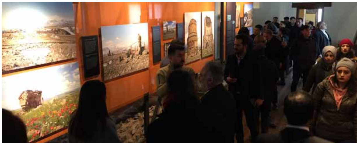
Exhibition on the ancient city of Ani, Kars, Turkey