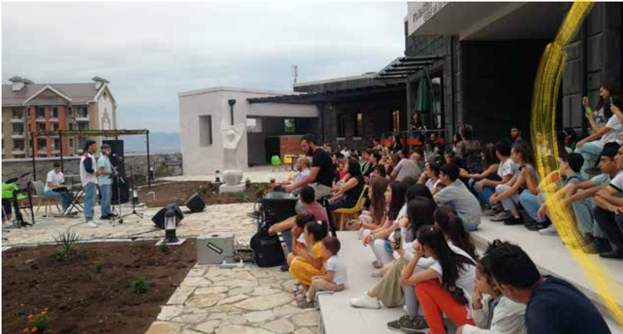
Sunrise Stepanakert 2022, cultural event, Stepanakert

The Armenian Communities Department of the Calouste Gulbenkian Foundation is a grant giving unit. It provides project grants and individual scholarships.