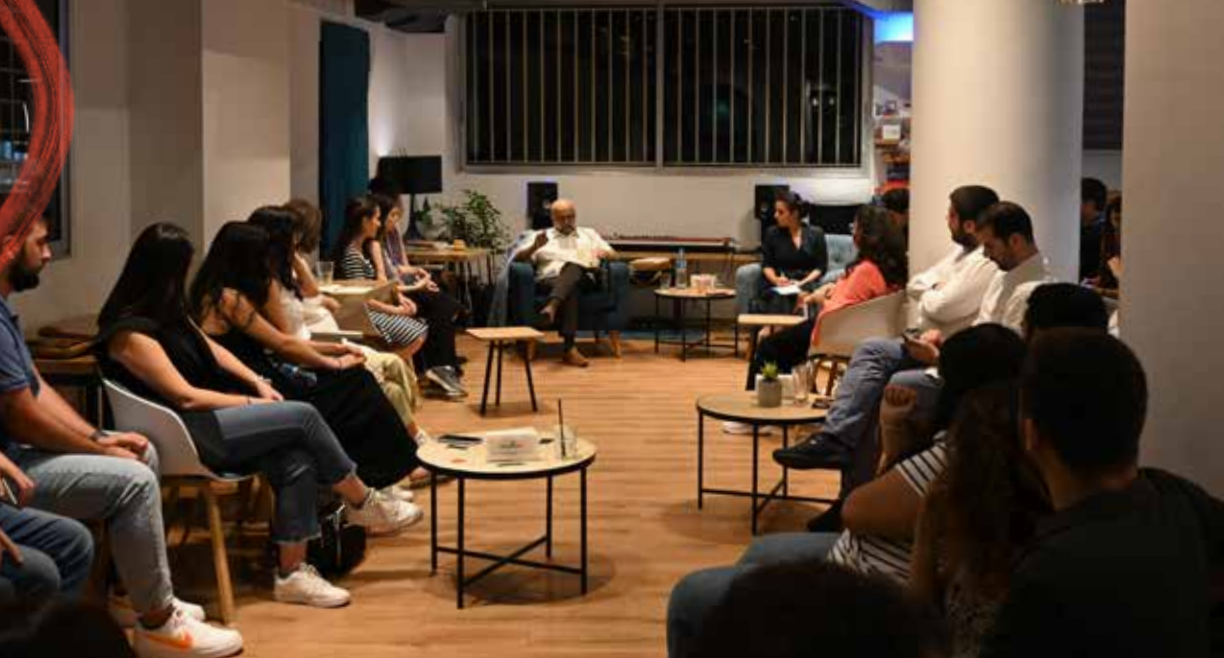
Exchanging views with youth, Lebanon, 2023.

To strengthen language, culture, and critical thinking in the Armenian world.