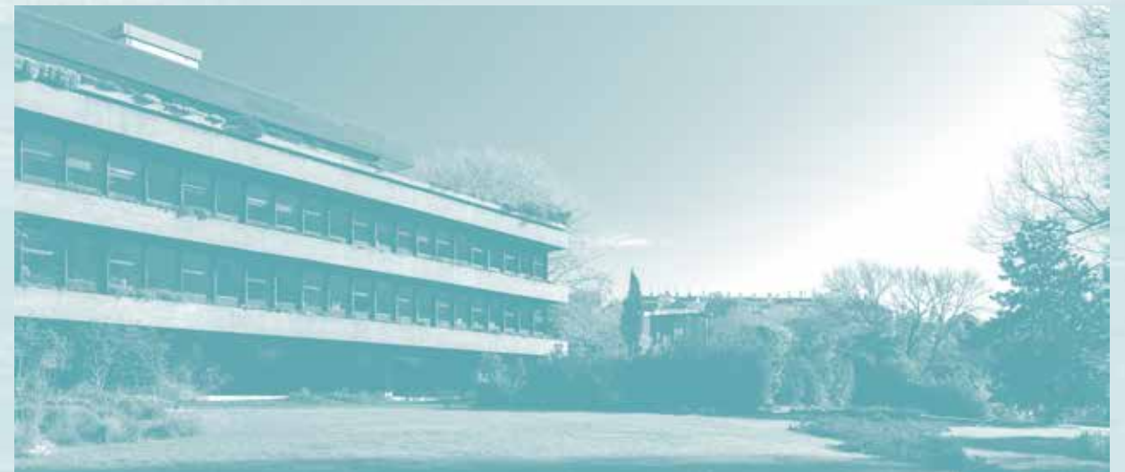
Calouste Gulbenkian Foundation

The Calouste Gulbenkian Foundation was created in 1956 by his bequest and continues to promote arts, education, science and charity throughout the world, as per the Founder’s will. The Armenian Communities Department, formerly named the Department for the Middle East, was set up at the inception of the Foundation.