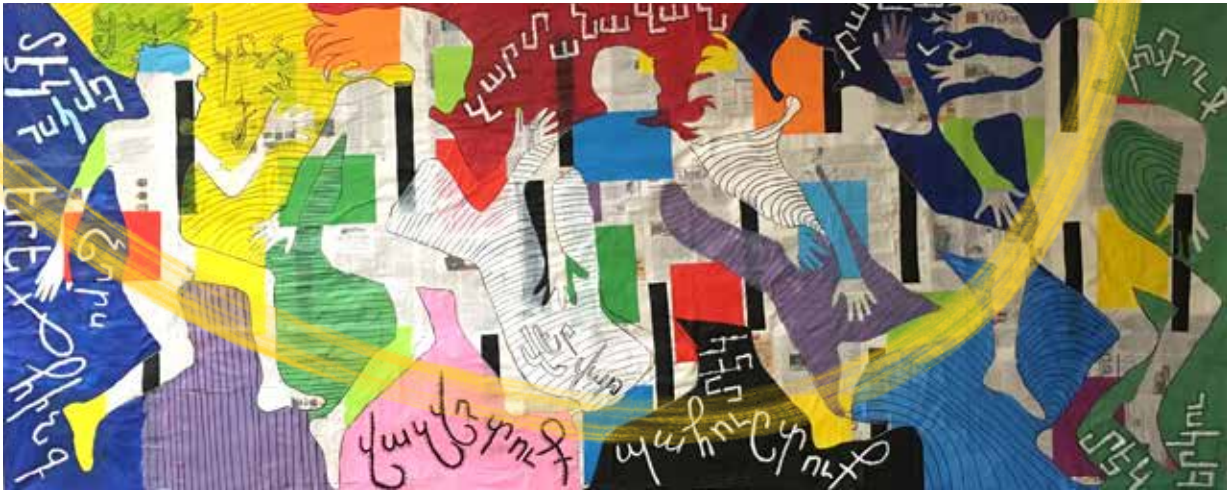
Zarmanazan summer language programme, France