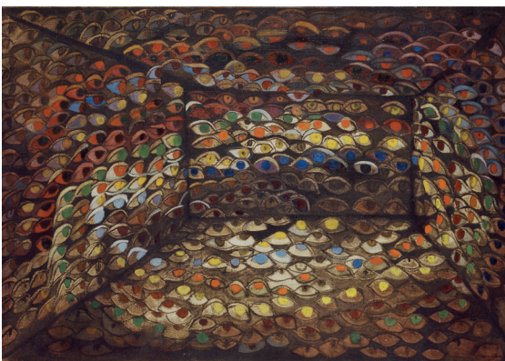
Maria Helena Vieira da Silva, La Scala ou Les yeux , 1937

Francisco Tropa invites us to witness the birth of an image—a reflection of a simple yet powerful natural phenomenon—reminding us of our condition as contemplators of the world. For this exhibition, the artist has created new projection lanterns, optical devices designed to help us grasp the tangible measure of time.