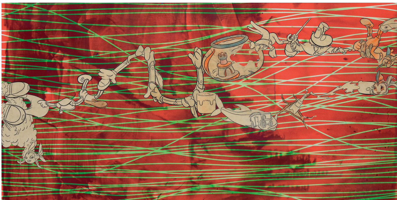
© Ana Vidigal, Não há como fugir do tempo , 2022.

THE CALOUSTE GULBENKIAN FOUNDATION LAUNCHES THE 7TH EDITION OF ITS NOW BI-ANNUAL CALL FOR PROJECTS, OPEN TO ARTISTIC INSTITUTIONS ACROSS FRANCOPHONE EUROPE