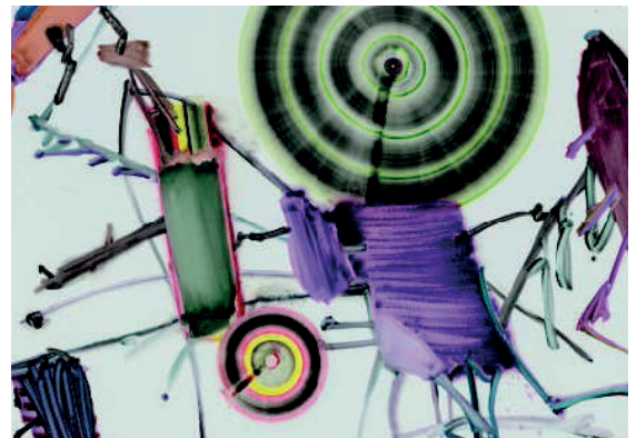
José Loureiro © ADAGP

The figure of Scheherazade in this exhibition embodies reflections on myth and its potential for social transformation. It questions the role of storytelling as a creative force for forging new individual and collective paths.