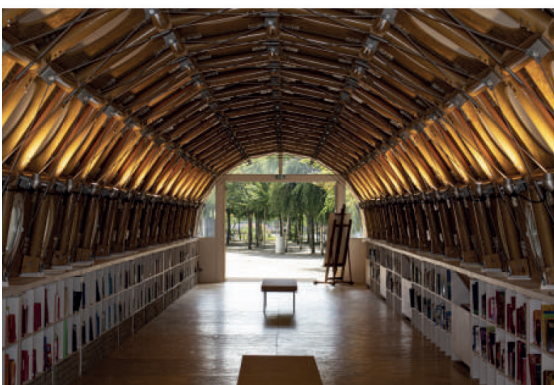
© Shigeru Ban Architects Europe et Jean de Gastines Architectes Photo : Centre Pompidou-Metz / Jacqueline Trichard / 2022

“CROQUE-COULEUR” is the first major solo exhibition in France dedicated to Portuguese painter José Loureiro. The invitation to the artist at Frac Grand Large promises a complete blurring of the lines between abstraction and figuration, with forms and colours animated by gravity and movement.