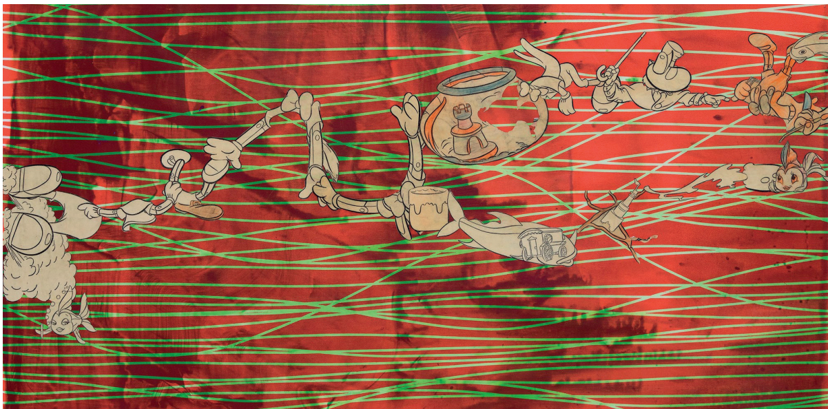
© Ana Vidigal, Não há como fugir do tempo, 2022.

The Delegation in France of the Calouste Gulbenkian Foundation is launching, from January 15 to March 15, 2026, the 8th edition of its call for exhibition proposals, dedicated to projects that highlight artists from the Portuguese art scene in five European countries.