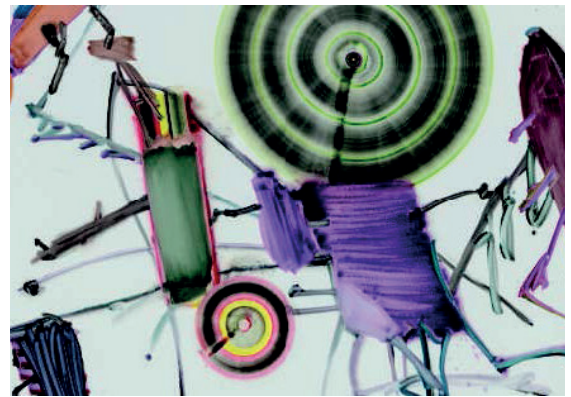
José Loureiro © ADAGP

The figure of Scheherazade in this exhibition embodies reflections on myth and its potential for social transformation. It questions the role of storytelling as a creative force for forging new individual and collective paths.