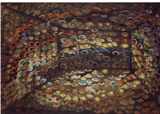
Maria Helena Vieira da Silva, La Scala ou Les yeux , 1937

Francisco Tropa invites us to witness the birth of an image—a reflection of a simple yet powerful natural phenomenon—reminding us of our condition as contemplators of the world. For this exhibition, the artist has created new projection lanterns, optical devices designed to help us grasp the tangible measure of time.