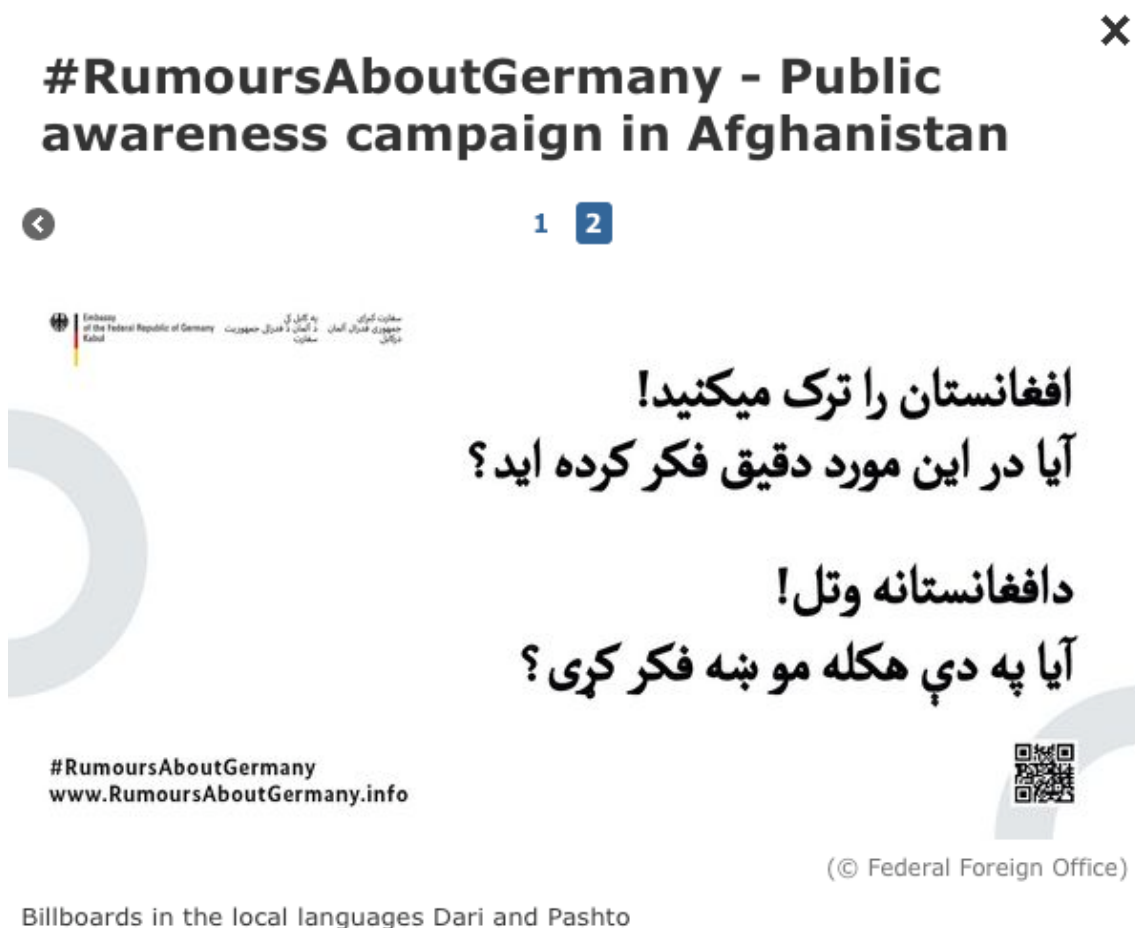
Figure 1. Sample of a billboard funded by the German Embassy. The text in Pashto and Dari languages reads: 'Leaving Afghanistan! Have you thought about it carefully?'

However, the campaigns have had limited results. European diplomats acknowledge 12 that billboards have little impact given that more than half the population is illiterate and where mistrust of information from official channels is high. Information campaigns may affect refugees' choice of final destination to the extent that such a choice exists but are unlikely to have an influence over the decision to leave the home country.