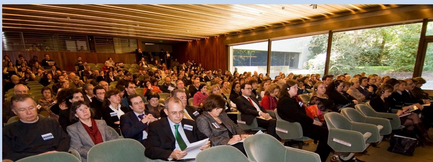
March 22 nd 2013: the Cidadania Ativa Programme was launched The Programme's website is available at www.cidadaniaativa.gulbenkian.pt