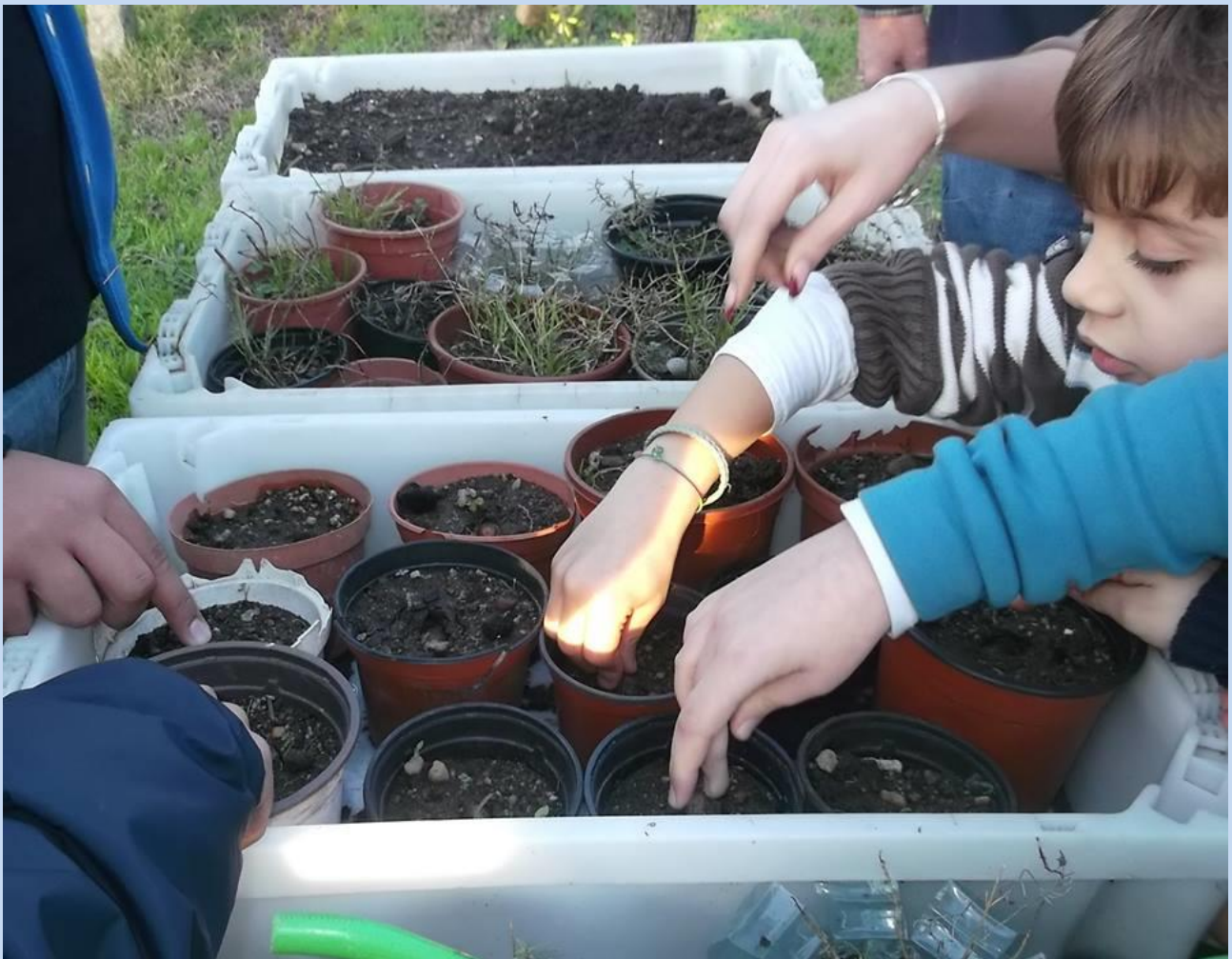
The Cidadania Ativa Programme will hopefully plant some seeds for a strengthened civil society and enhanced contribution by the NGO sector to social justice, democracy and sustainable development in Portugal. These children are participating in project A12-200084 “Education Centre for Sustainability”, promoted by Green Wave, an NGO from the Porto Metropolitan Area