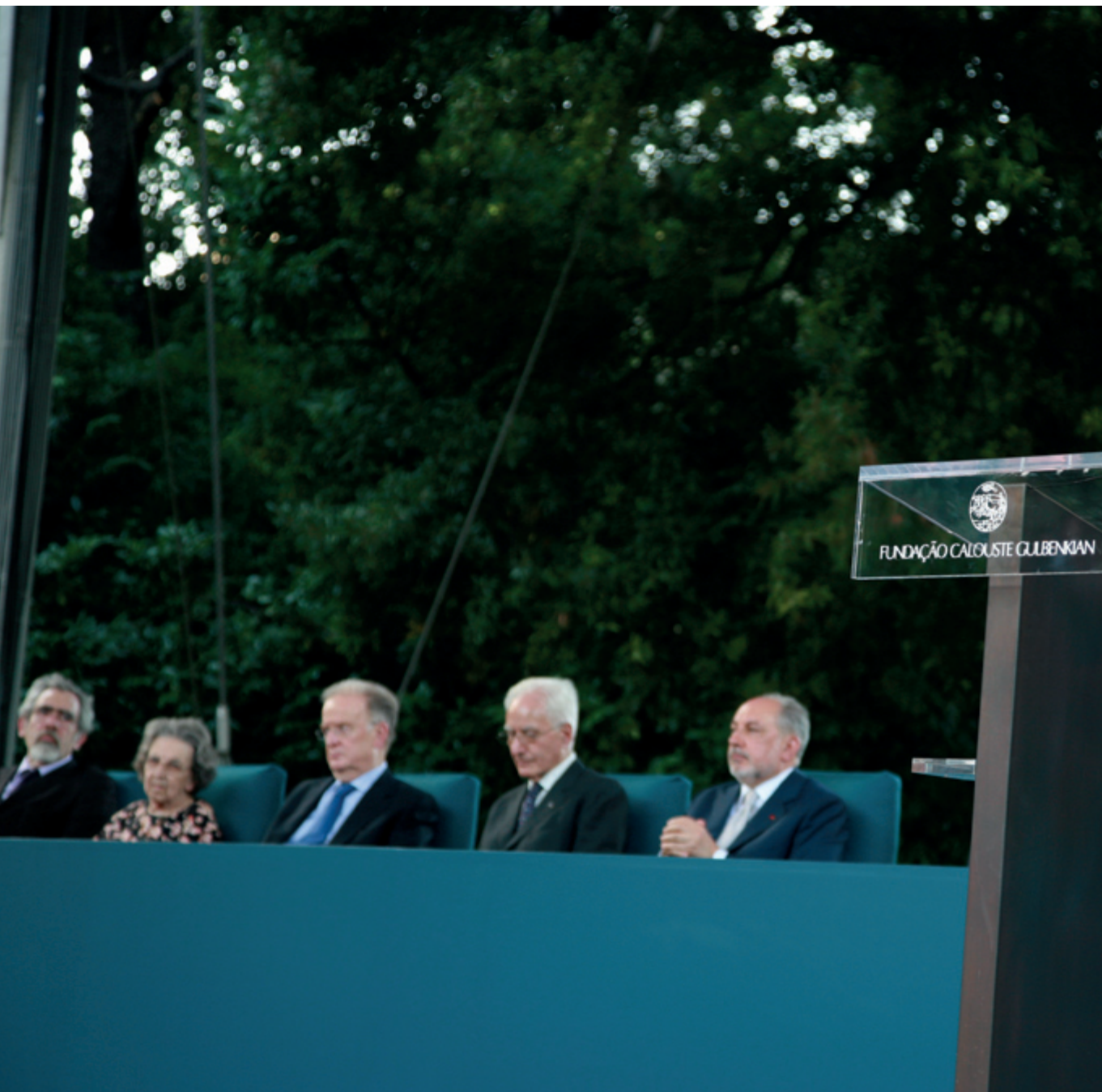
✦ Gulbenkian Prize Award Ceremony. Speech by the United Nations High Commissioner for Refugees, António Guterres.