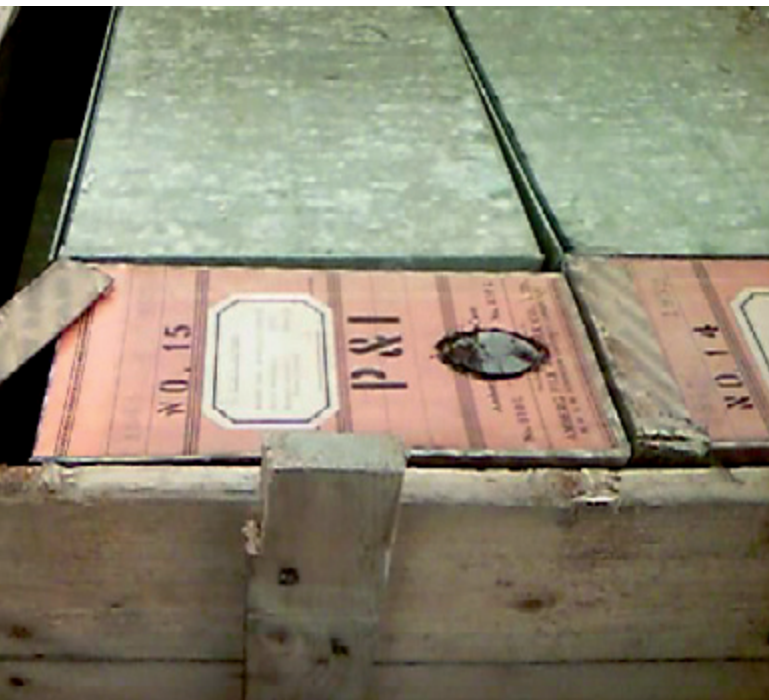
✦ Calouste Gulbenkian Archive arriving from London: crate containing the Founder's personal diaries.

This group of documents includes the following archives: the former Overseas Department, the former Cooperation with the New African States Department, the former Cooperation for Development Department and some documents from the International Department. The size of these archives at the beginning of the document treatment process was 130.05 metres in length.