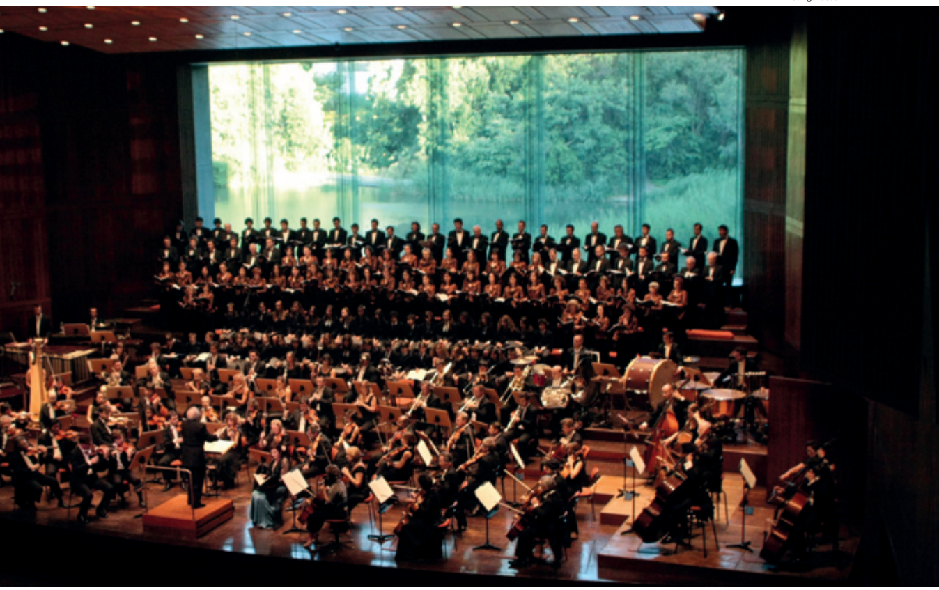
... The Gulbenkian Choir and Orchestra conducted by Lawrence Foster, Grand Auditorium, 14 May 2009.

Various training activities were also organised, including some sessions that were held in conjunction with the Orguestra Geração and with the Orchestra of the National Conservatory of Music.