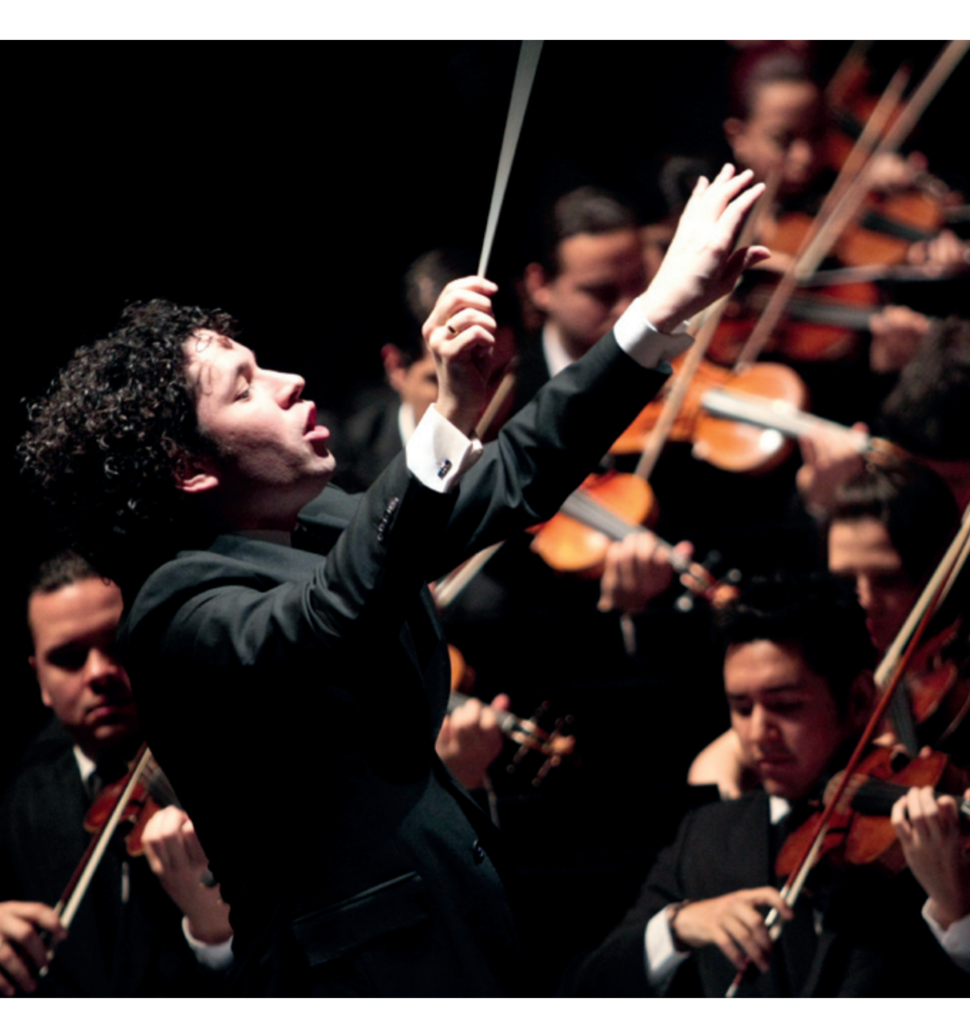
🔥 "Great World Orchestras" Cycle: Gustavo Dudamel conducts the Simón Bolívar Youth Symphony Orchestra, Coliseu dos Recreios, 25 April 2009.