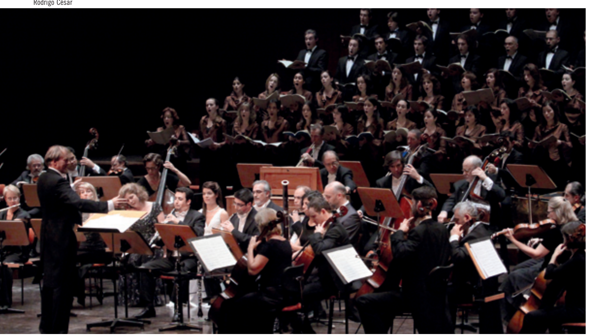
- Thomas Hengelbrock conducts the Gulbenkian Choir and Orchestra, Grand Auditorium, 4 December 2009.