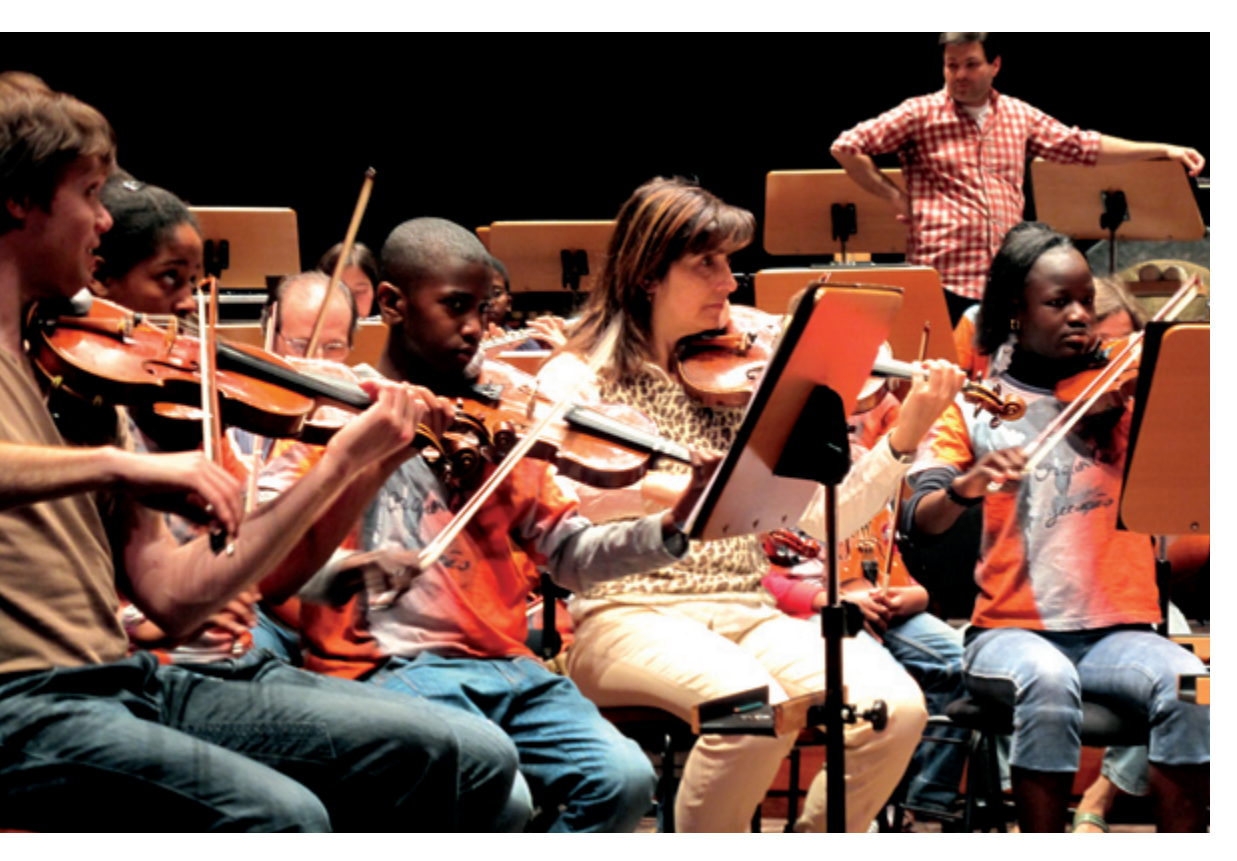
Members of the Orguestra Geração at a rehearsal-workshop with the Gulbenkian Orchestra, Grand Auditorium, 25 March 2009.

Two rehearsal-workshops were also held with the Gulbenkian Orchestra, aimed at students belonging to the Orchestra of the Lisbon Conservatory Music School and the Orquestra Geração. Both rehearsals culminated in the joint interpretation of pieces that had been prepared previously. In the course of 2009, 21 workshops were held, resulting in a total of 100 sessions, involving 2,164 participants.