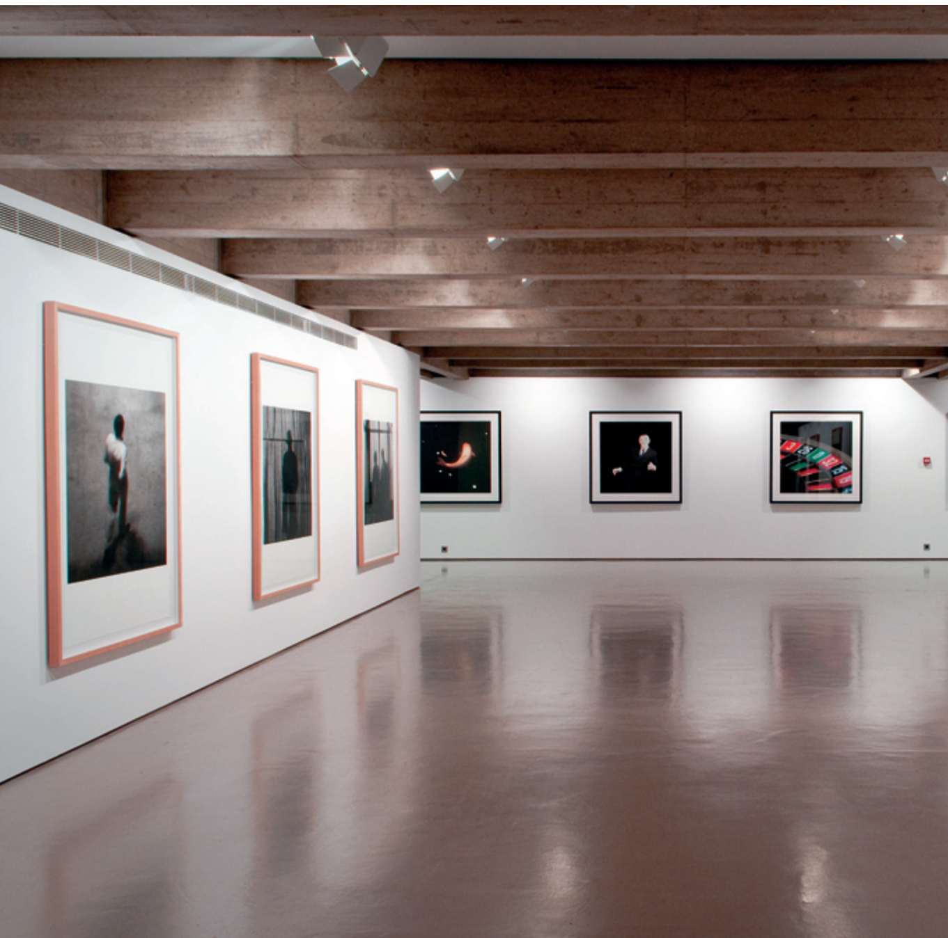
Aspect of the exhibition "The Interpretation of Dreams. Photographs by Jorge Molder".