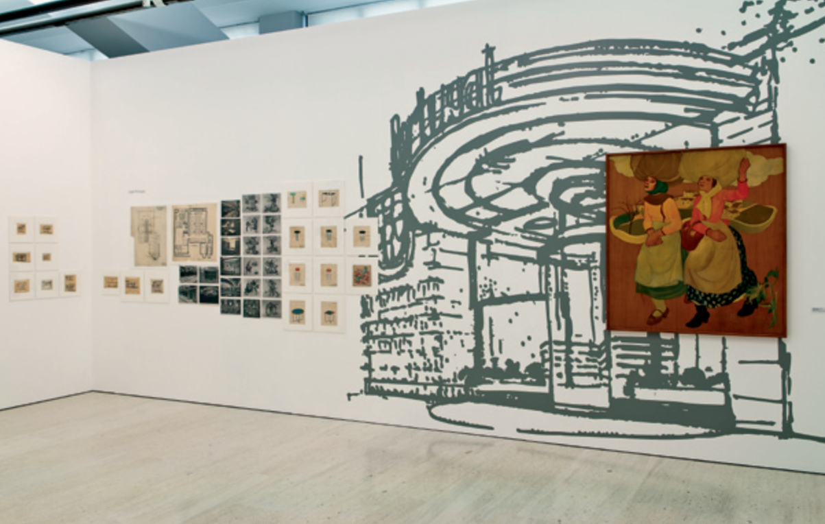
✚ View of the exhibition “Aspects of the Collection”.