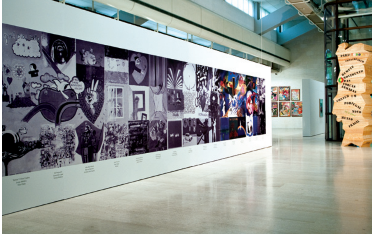
Aspect of the exhibition “The 70s – Crossing Frontiers”.