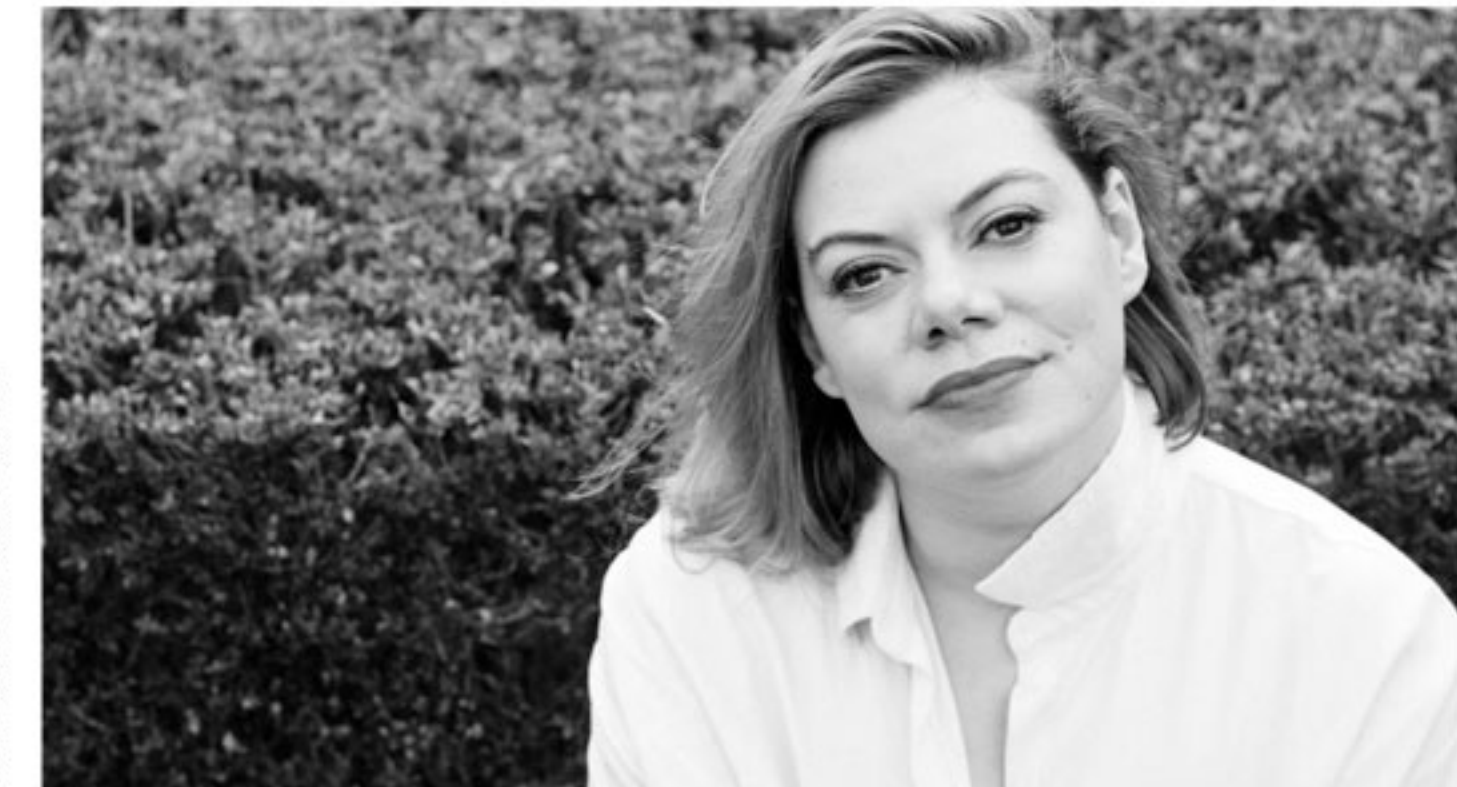
© Miguel Refresco Curva Contra Curva