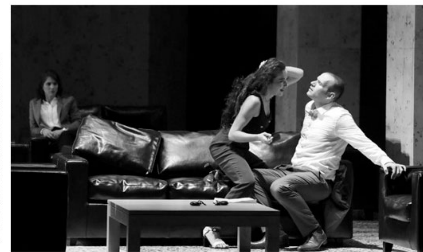
Carmen © Patrick Berger/ArtComPressA

Screening of the Opera from the Aix-en-Provence Festival