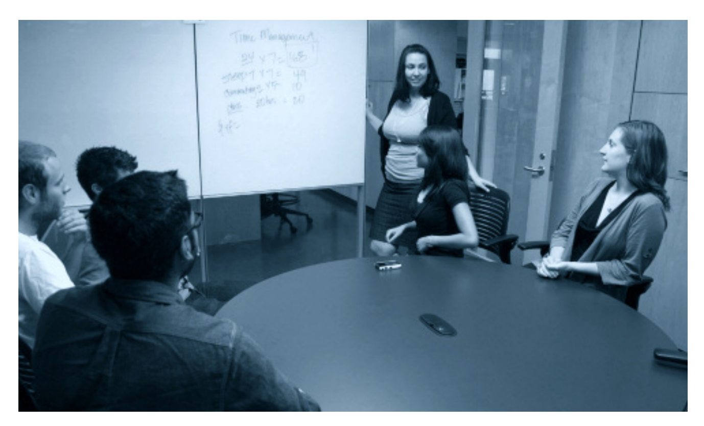
Preparing for transitions is central to adjustment.

Others may be too occupied with the present and may not grasp how changes could affect them.