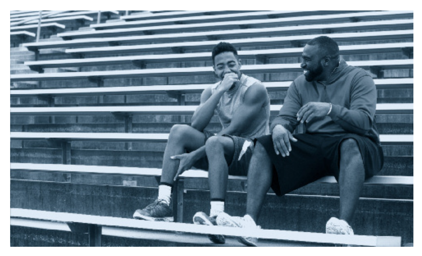
Mentoring tackles behaviour and attitude, and can have a significant impact on the aspirations of disadvantaged young people.