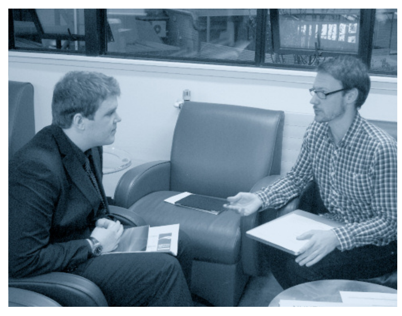
Entering the job market can be difficult if you haven't had an opportunity to gain work experience.

The researchers assess what works in terms of building resilience and wellbeing, and highlight opportunities and barriers to successful models.