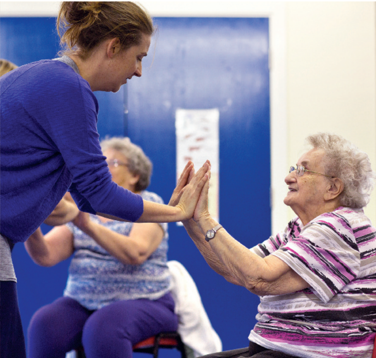
Yorkshire Dance presents Dancing in Time.