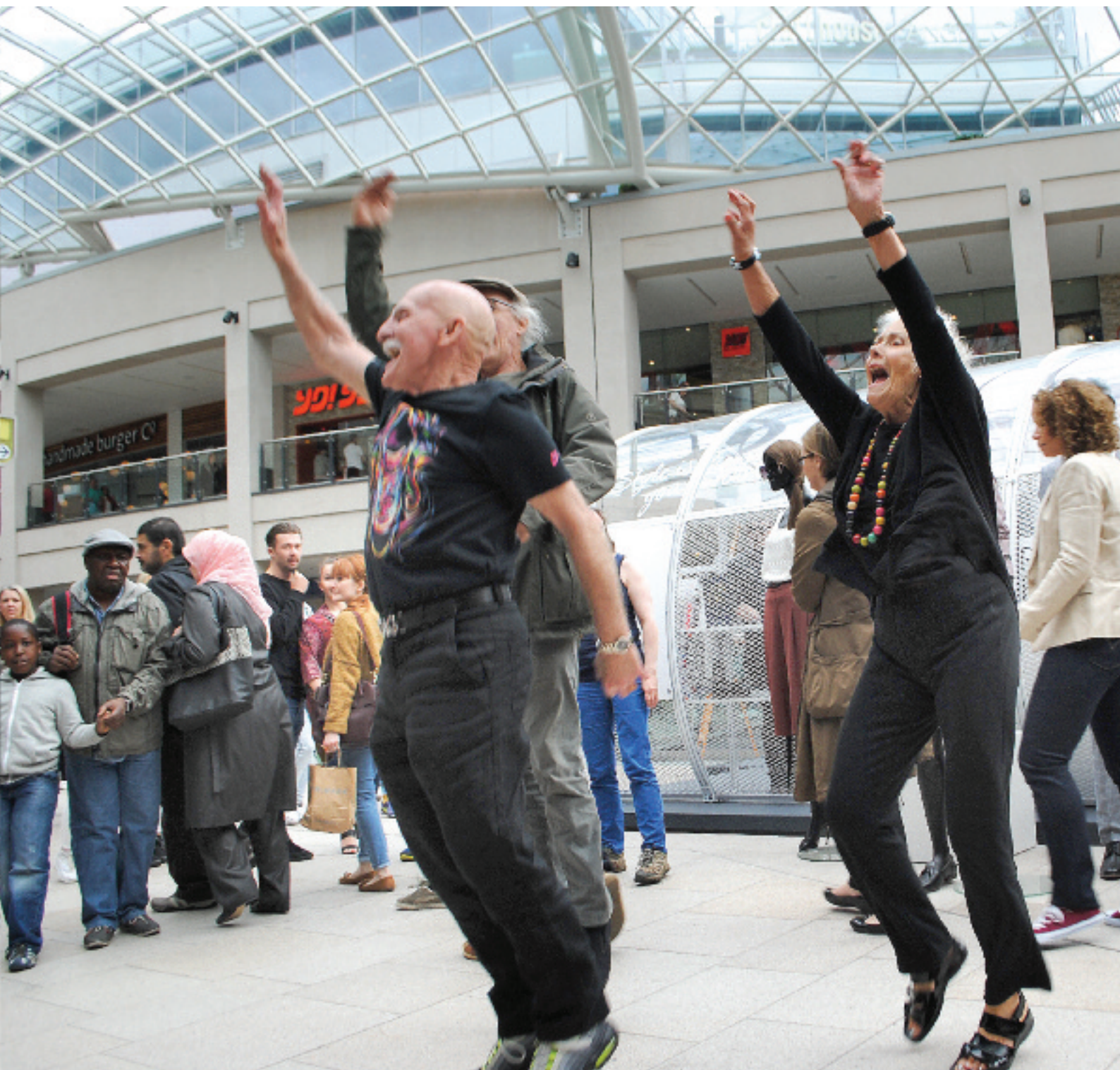
The Dance Leeds Made, 6 June 2015.