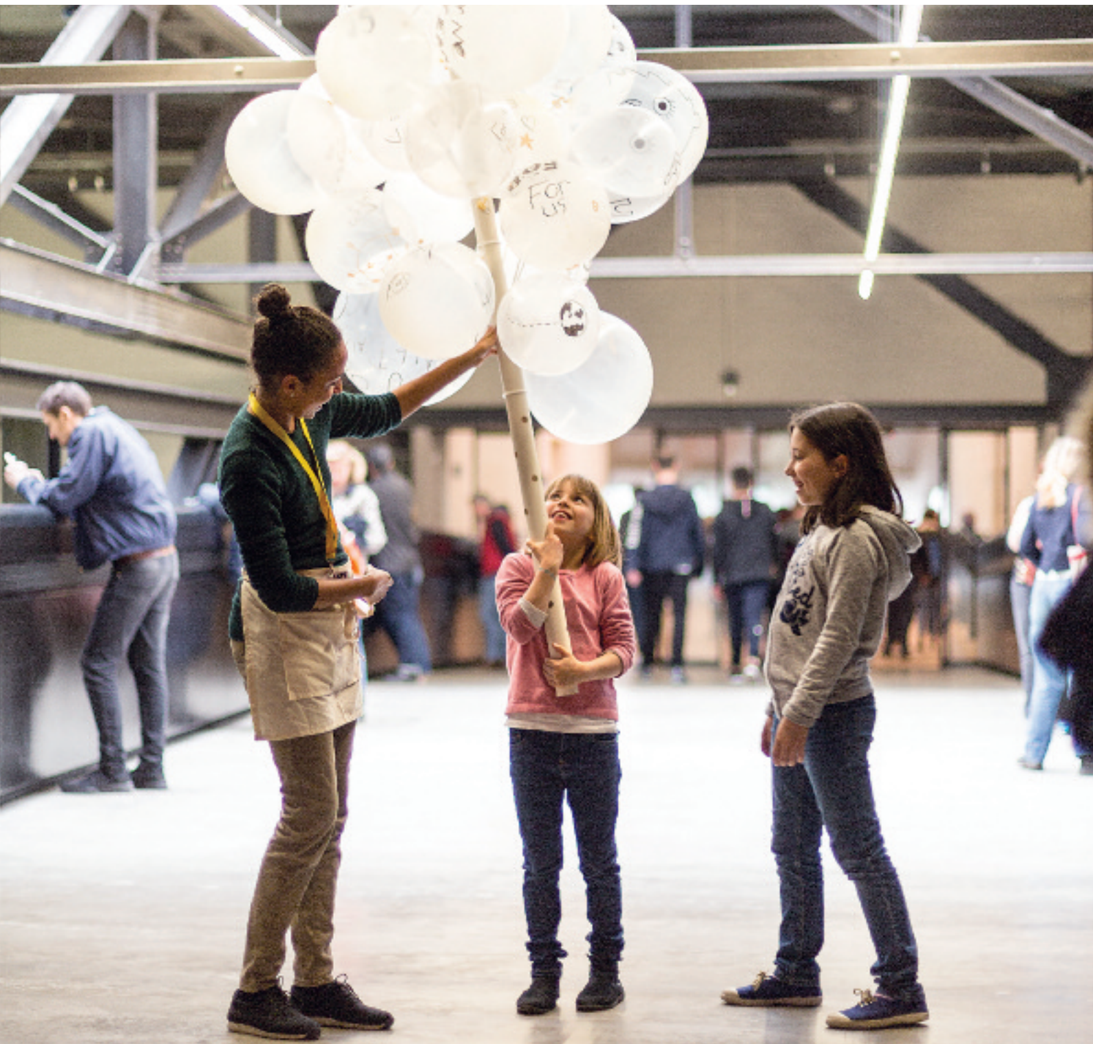
For Me, For You, For Us, People United.