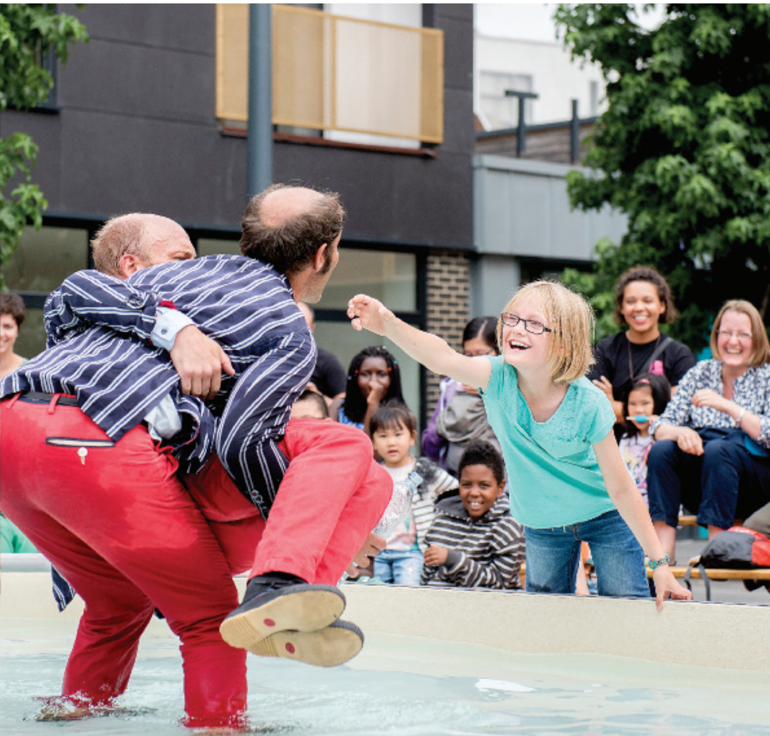
Barolosolo's ILE O in Griffin Square, Deptford as part of Circulate 2016.